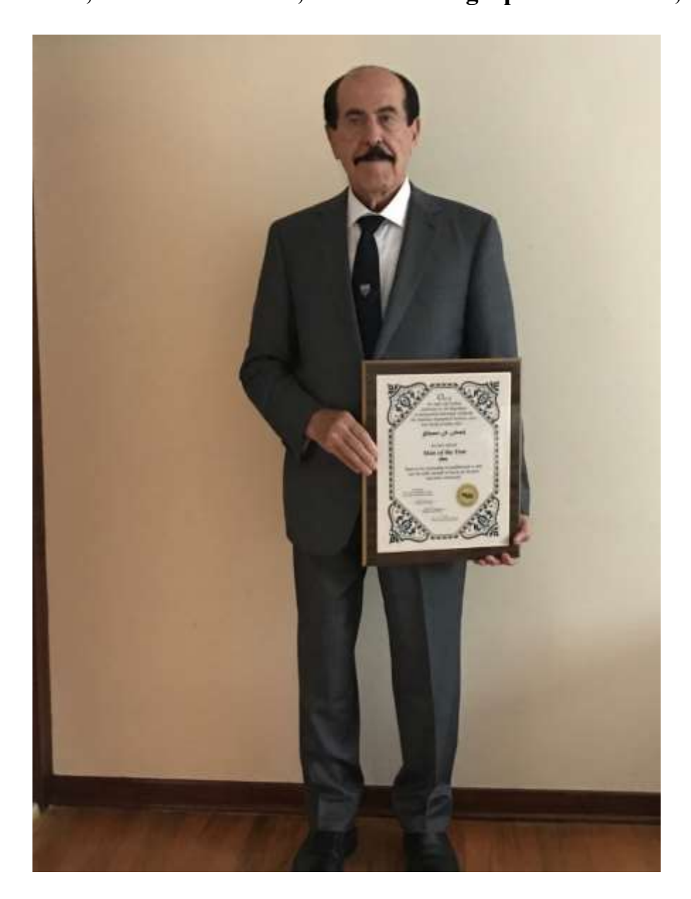
1995 Designate Certificate. "Man, of the Year 1995", American Biographical Institute, USA, 1995 Designate Certificate. "Man, of the Year 1995", American Biographical Institute, USA, 1995